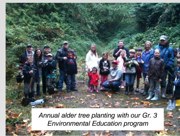
Annual alder tree planting with our Gr. 3 Environmental Education program