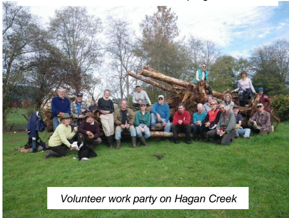
Volunteer work party on Hagan Creek

For more information about Peninsula Streams Society activities, volunteering, to make a donation, or to become a member, please contact: