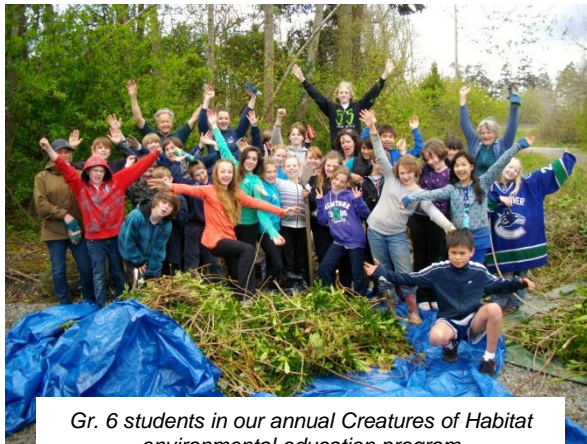
Gr. 6 students in our annual Creatures of Habitat environmental education program