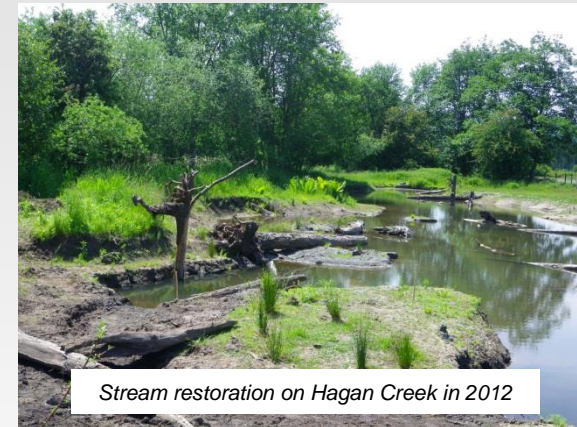
Stream restoration on Hagan Creek in 2012