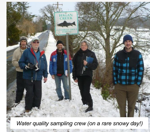
Water quality sampling crew (on a rare snowy day!)