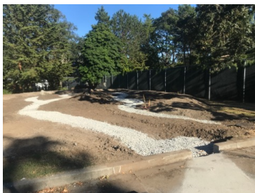
Rain garden at Monterey Middle School

Since 2019, we have identified sites for rain gardens and developed partnerships with schools, stewardship groups, and municipalities. We help communities by providing tools and knowledge to design, plan, fund, install, and maintain their own rain gardens.