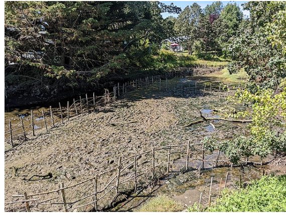
Mermaid Creek ( Completed September 2022 )