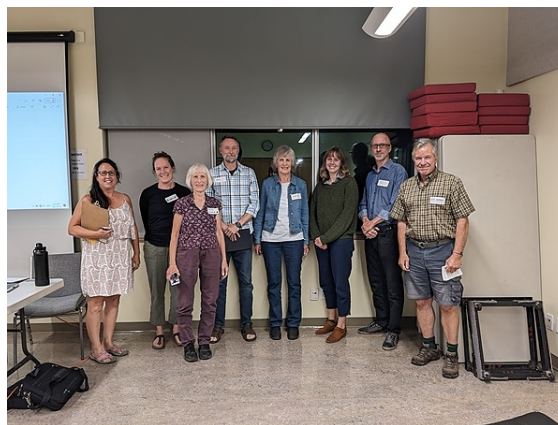
The Board of Directors for the newly established Friends of Millstream Watershed.

West Shore for its first Annual General Meeting. On the new 9-member Board of Directors there is representation from all 4 municipalities that are within the watershed: View Royal, Colwood, Langford and the Highlands!